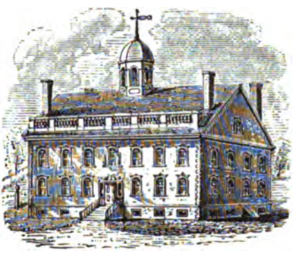
FIRST STATE-HOUSE AT NEW HAVEN. Commenced in 1763; occupied in 1764; brick.